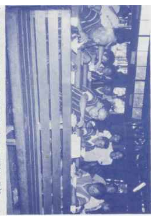
Delegates of the Central Pol. and Mily. Meeting at Noon Tiffin