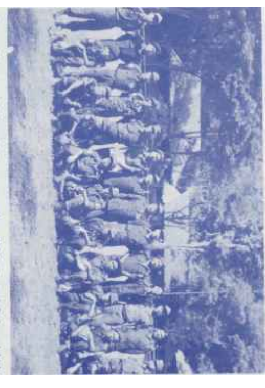
Group Photos of Mily. Officers attending KNU Central Pol. and Mily Meeting.