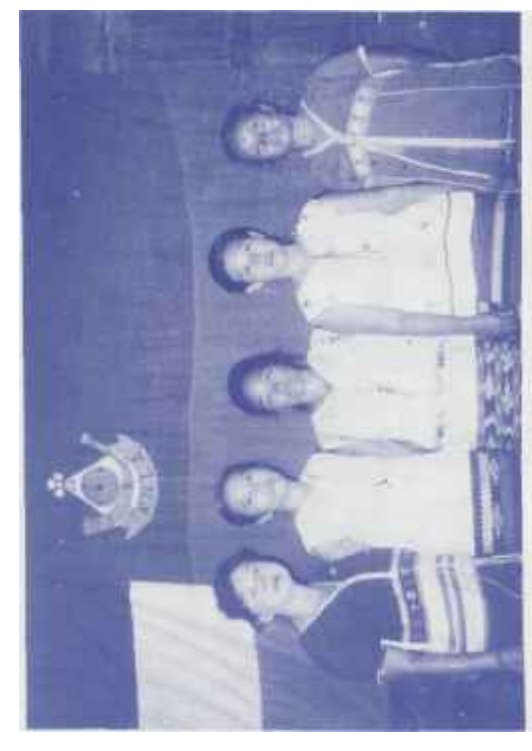
Delegates of KWO (Kawthoolet Women Organisation) attending Central Pol. and Mily. Meeting.