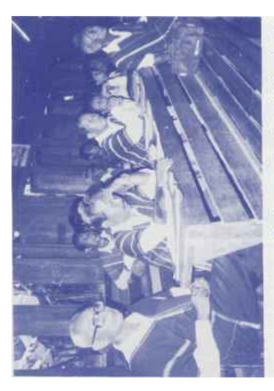
KNU Central Committee Menbers attending Central Pol. and Mily-Meeting.