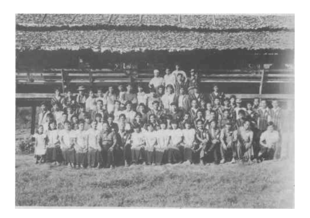
1987. Central Pol. Training Course Trainees.

Martin Smith. It appears like that at first sight. I mean it would be very surprising if it is not followed up very quickly by some new law clearing up the currency situation. And it would be surprising if there was no compensation offered at all, but certainly Ne Win in recent weeks has been talking more openly than at any time in recent memory about the problems facing the country. But I think it is just an indication of how serious the trouble has become both on the military front fighting the various insurgents round the country and domestically in just economic production.