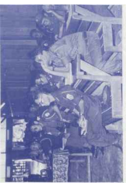
KNLA Mity. Officers attending Central Pol. and Mity. Meeting