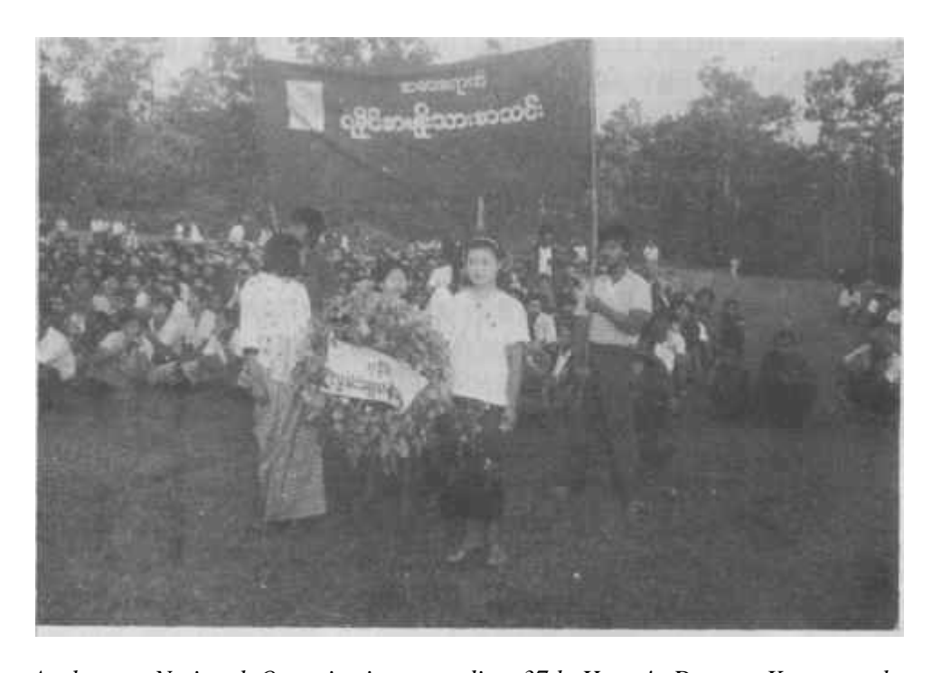
Arakanese National Organisation attending 37th Heroe's Day at Kawmoorah.