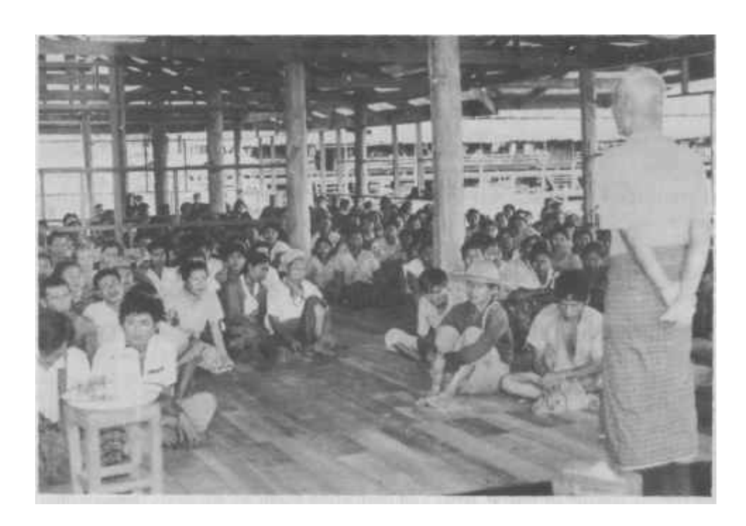
Mass Meeting at Kler Day Gate.

It seems that there is still a long way for U Ne Win and his BSPP military government to go in order to see the light and mend their ways for a peaceful solution to the problems in the country.