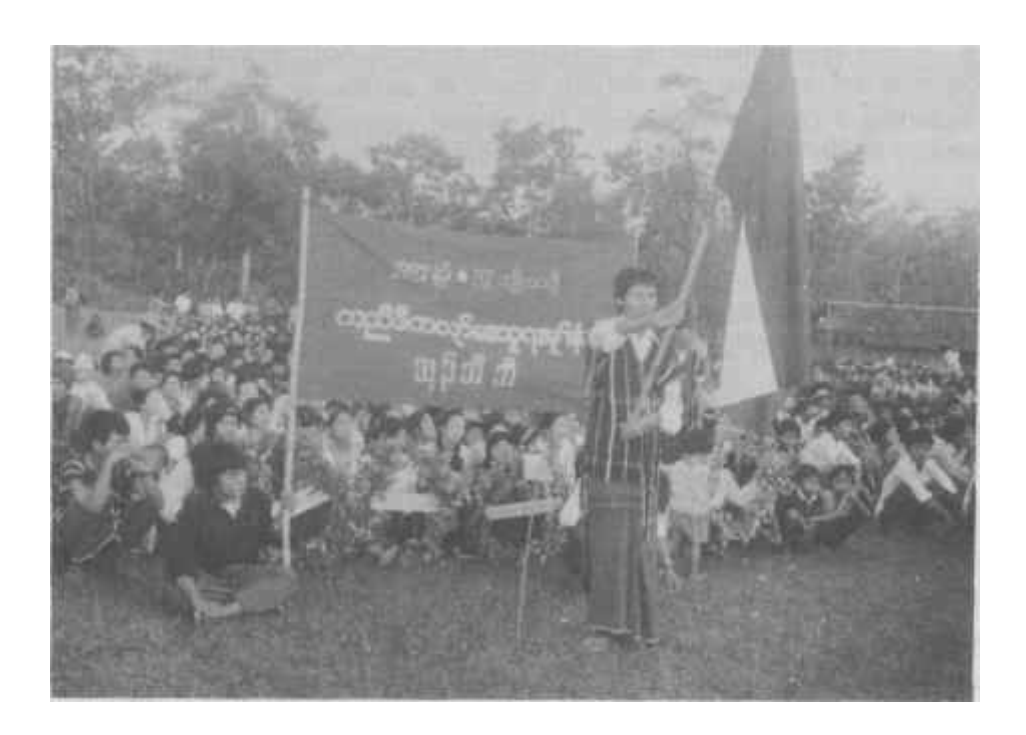
37th Martyrs Day Ceremony at Thay-Baw Bo.

It could only be concluded that these shortcomings are a result of inefficiency in management and misconception of current situation. No great pain has been taken by the government to achieve the desired goal and apart from that, those concerned in every department strive more for personal gains rather than for the good of the country. The present economic policy of the country met with failure because of the erroneous political policy of the Burmese government. Under existing political policy of the Burmese government, any aid from the UN or from other countries would acquire nothing to help the country develop. Burma may receive loans from other countries and Burma may be given the status of Least Developed Country and enjoy better foreign credit terms and all its debts exempted. But the people of Burma who comprise also of the various ethnic groups in the country will never benefit from all these priveleges.